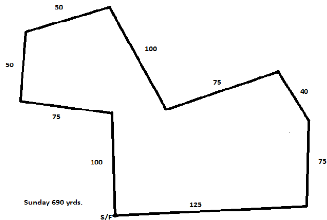
Sunday 690 yds.